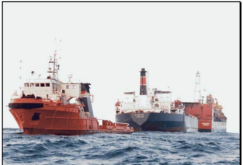
Grampian Prince on location