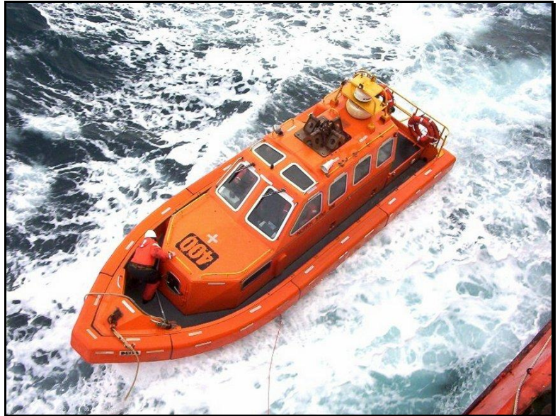
Delta Phantom Diesel Daughter Craft