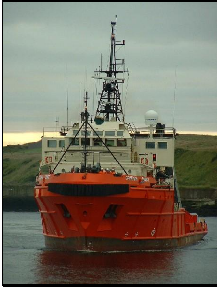
Grampian Prince in Port