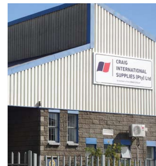
CIS Pty's new base, Cape Town.

CIS can supply the entire range of products for all seismic, drilling, exploration, production and transportation operations in the oil and gas industry. In conjunction with these services all three offices are now linked via video conferencing.