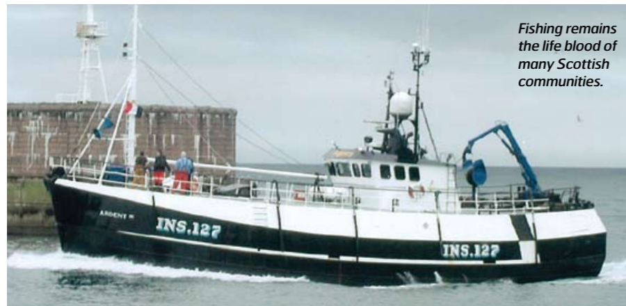
Fishing remains the life blood of many Scottish communities.

An economically viable and healthy fishing industry for the future is undoubtedly required and Scottish fishermen need to be held accountable for the stewardship and planning of their own fisheries, now and for future generations.