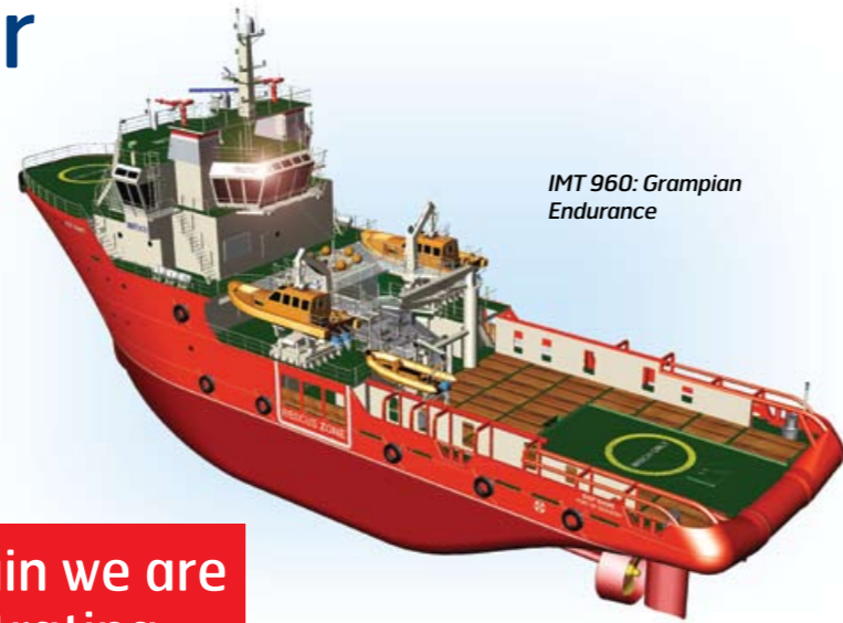
IMT 960: Grampian Endurance

“Our ongoing investment in the fleet is a clear indication to customers that we value our position in the market for the provision of safe, modern, high quality vessels”.