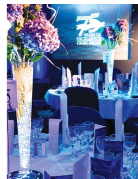
Craig Group's 75th anniversary was celebrated in the Marcliffe Hotel.

One of Aberdeen's most famous family businesses marked the occasion by hosting a glittering event at the Marcliffe Hotel, where it announced its move from Aberdeen Harbour to the city's West End.